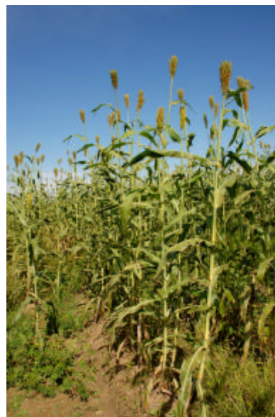
Fig. 1: Sweet Sorghum Plant

Due to low water requirement for cultivation and processing, sweet sorghum can be grown throughout the temperate climate zones of Asia and the Americas.