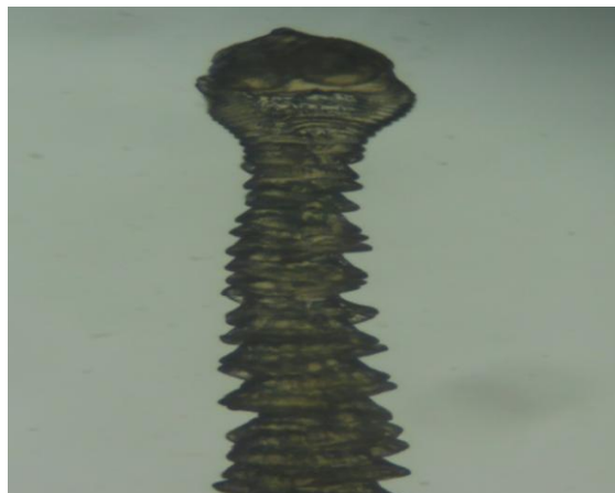
Fig. 4. Choanotaenia infundibulum with triangular and anteriorly pointed scolex. Segments are wider posteriorly with pointed corners giving the worm a saw-edge appearance.