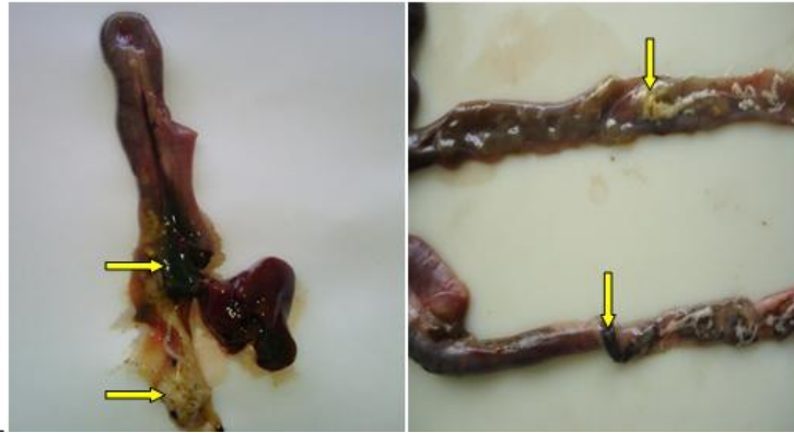
Fig. 2(a-b). Intestinal lumen of affected Japanese quail (duodenum and jejunum) severely filled with tapeworms and dark red exudates (arrows). The duodenal mucosa is thickened and hyperaemic. The intestinal tract has been incised to expose the heavy load of the cestodes.