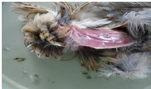
Fig. 1. Severe emaciation of the breast muscle with prominent keel bone in one of the infested Japanese quails.

The tapeworms were identified microscopically as Choanotaenia infundibulum and Raillietina echinobothrida . The scolex of Choanotaenia infundibulum was identified to be triangular in shape and pointed anteriorly. The worms measured 10-15 cm long bearing rostellum hooks, the sucker is almost round in shape, the neck is narrow, short and followed by broad segments which gradually increased in length. The mature segments are more or less bell shaped, broader posteriorly than anteriorly with pointed posterior corners giving the worm serrated appearance (fig 4). The scolex of Raillietina echinobothrida is spherical in shape, the worms measured up to 25cm with short and broad neck, the rostellum is retractile and armed with hooks, the sucker is oval in shape also armed with hooks. (fig 5).