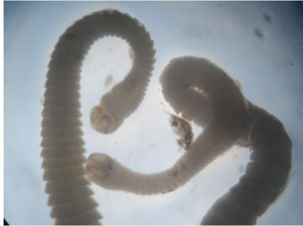
Fig. 5. Raillietina echinobothrida with the scolex spherical in shape, the worms measured up to 25cm with short and broad neck. The sucker is oval in shape and armed with hooks.