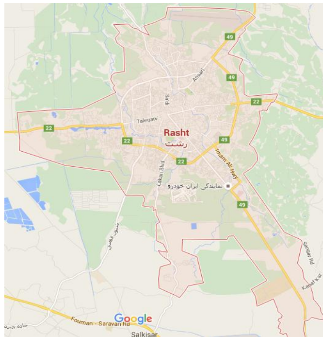
Fig. 2: Rasht City