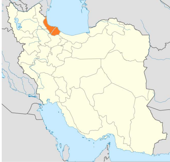
Fig. 1: Gilan Province